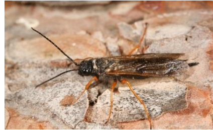
Sirex Woodwasp, nysi.info